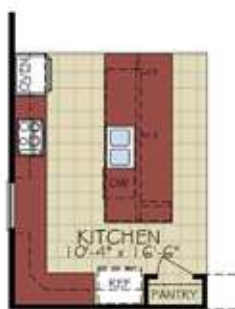
OPTIONAL DELUXE KITCHEN