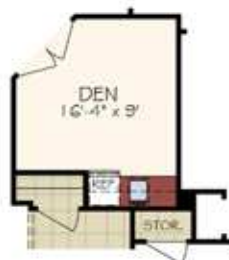
OPTIONAL DEN WET BAR