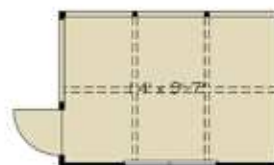
OPTIONAL OWNER SCREENED PORCH