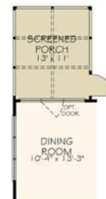
OPTIONAL LIVING SCREENED PORCH