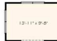
OPTIONAL OWNER SITTING ROOM