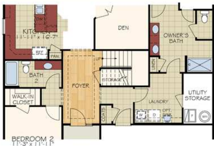
FIRST FLOOR PLAN WITH OPTIONAL BONUS SUITE

1,888-2,740 Square Feet (depending on structural options)