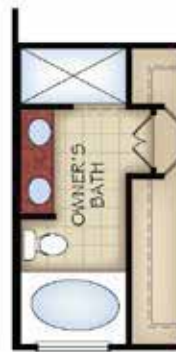
OPTIONAL OWNER'S BATH