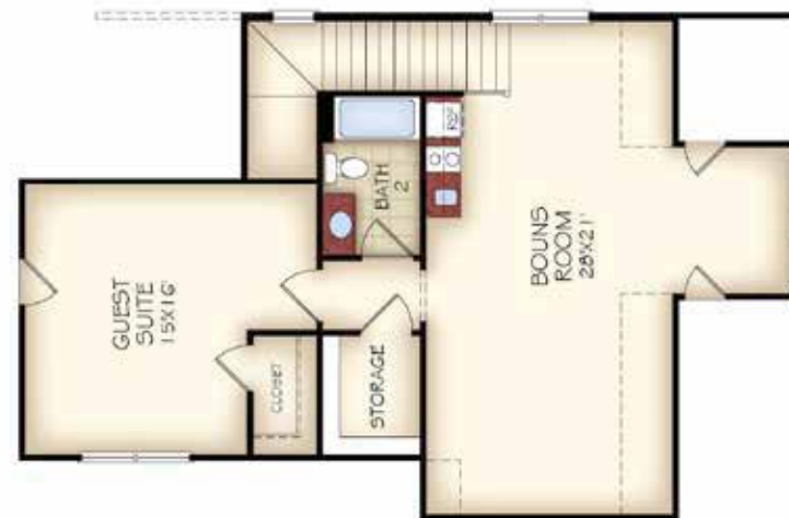
OPTIONAL UPPER LEVEL

Floor plans are for illustration purposes only. Some features and specifications may vary depending on the architectural style. © Epcon Communities Franchising, Inc. 2015